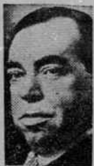
Irvin S. Cobb

Still, it's no wonder that the word hasn't got around generally yet, because this present era is quite a young era as eras go. It's merely a few million years old, which, to our true geologist, is the same as yesterday. Mention a few million years to him and he'll say "phew!" and just snap his fingers—like that.