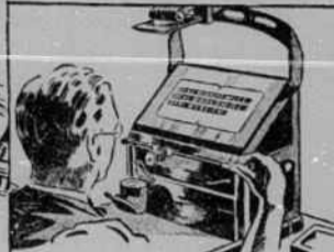
EACH "HEAT" OF ALLOY IRON AND STEEL MADE IN THE FORD ROUGE FOUNDRY IS ANALYZED BEFORE IT IS POURED BY TAKING PHOTOGRAPHS OF THE SPECTRAL "RAINBOWS" FORMED BY ITS ELEMENTS.