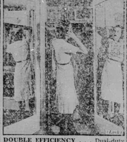
DOUBLE EFFICIENCY . . . Dual-duty theme of No 1 House in "Town of Tomorrow" at New York World's Fair is illustrated here by placement of plate glass mirrors on facing closet doors, feature which hostesses report draws thousands of "ohs" and "ahs" daily from feminine visitors. Mirrors multiply apparent space and double efficiency throughout the modest house.