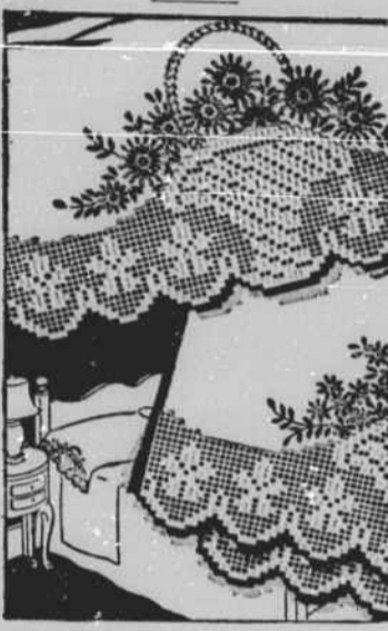
Pattern No. 6681.

FLOWERS in simplest stitchery fill these easily crocheted basket edgings. Take your pick of pillow cases, towels or scarfs.