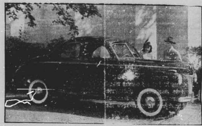
1941 Ford DeLuxe Coupe. Like the rest of the Ford line for 1941, it is longer, wider, easier riding, with added beauty of line and finish.

At the meeting it was announced that the new troop at Hayesville would be publically installed Wednesday evening. October 2 Following the public installation there will be a short conference of the troop committeemen of all the Troops in Nantahala District. The next district court of honor will be held November 5.