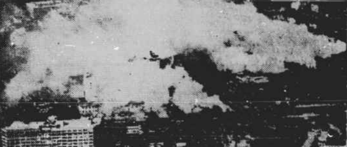
TOKYO SMOKE —This air view of Tokyo, capital of Japan, shows smoke rising from city after Japs had dropped "bombs" in test air raid drill. According to Tokyo radio this raid was made a reality as Japs announced that enemy bombers have attacked the city for the first time.