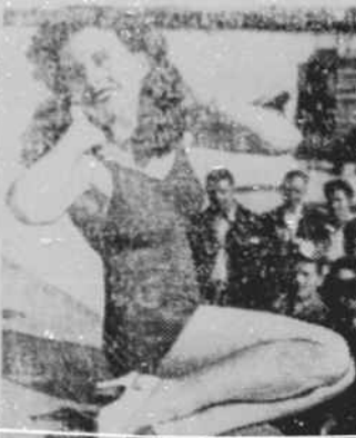
CAMERA QUEEN —Jeanne Crain, 17, was selected "Miss Camera Queen of 1942" by amateur photographers in contest at Long Beach, Calif.