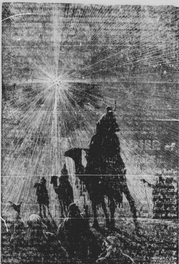
And lo, the Star went before them.

Units of the Mountain Center comprises the first Mountain Troops in the history of the U. S. Army. Men in this tough outfit must be triple-threats, able to ski, ride, and scale mountains with equal ability. All applications for assignment to this unit must pass through the National Ski Patrol, 415 Lexington Avenue, New York City.