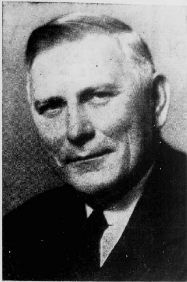
NOMINATED GOVERNOR — Gregg Cherry of Gastonia, who was nominated governor of North Carolina in the primary held in the state Saturday.