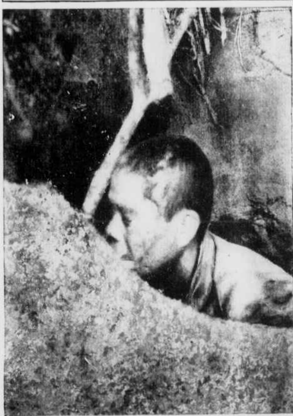
This is one of the most unusual pictures to come out of the war. Here is a Jap sniper who had hidden himself in an American foxhole, then dug it a little deeper. But sharp eyed doughboys discovered him. Here you see him, crouched down, miraculously dodging bullets and grenades that Yanks shot and lobbed at him. When this picture was taken he was alive, but not the fear of death on his face. A few moments later he died in a hail storm of American lead. Back our boys up who are fighting such men as these by buying War Bonds.