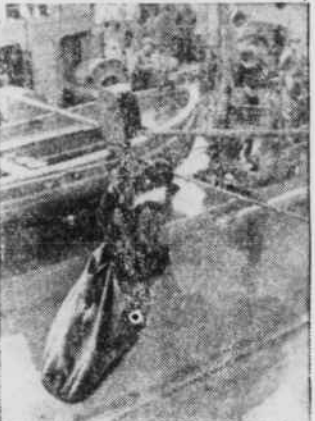
His plane forced down in the Mediterranean, this Navy flier goes back to his own ship, after being rescued by one of the modern, fast-moving destroyers bought through your war bond purchases. More Bonds mean more and better equipment. Keep buying War Bonds regularly. U. S. Treasury Department