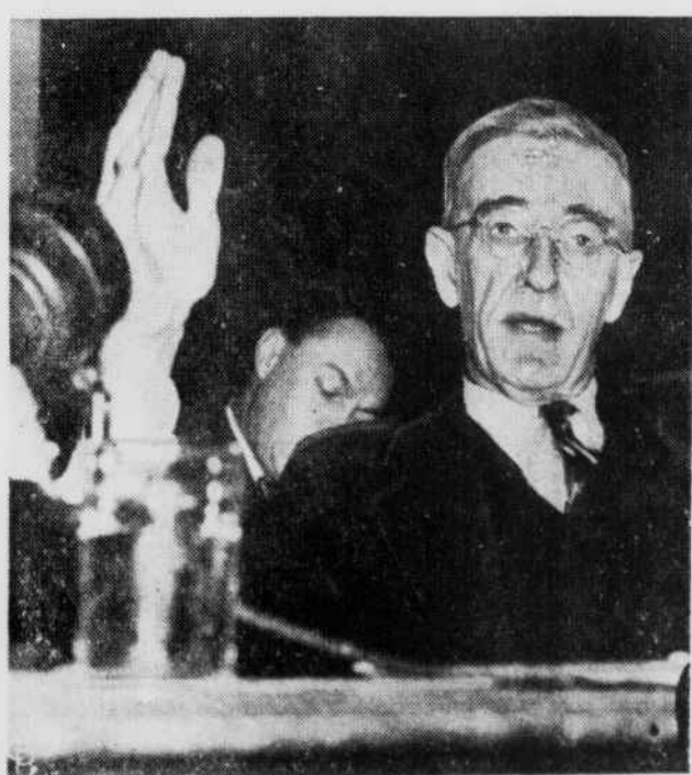
DIRECTOR OF THE OFFICE of Scientific Research and Development, Dr. Vannevar Bush is shown on the stand in Washington as he warned a Senate committee considering the atom bomb problem against "premature outlawing" of the weapon.