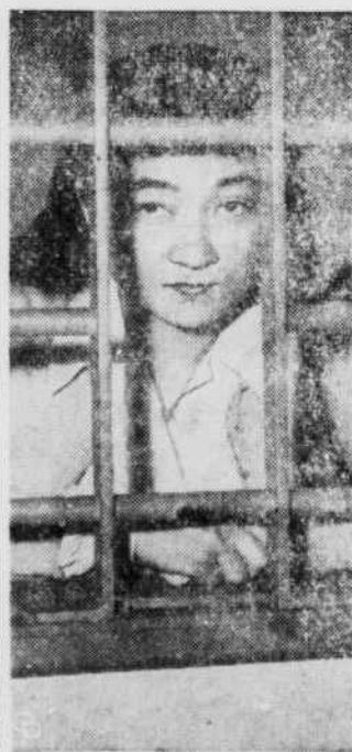
LOOKING OUT through the barred window of her cell in Tokyo is Iva Toguri, better known as "Tokyo Rose." The 29-year-old Los Angeles-born American of Jap ancestry is awaiting trial for treason against the U. S.