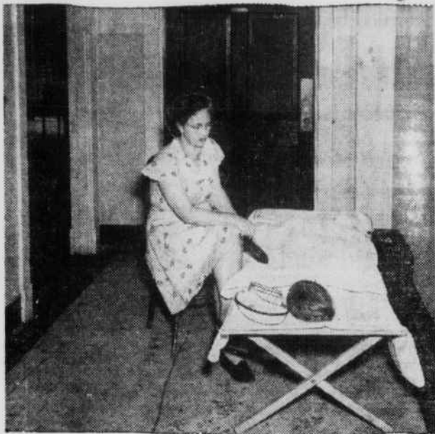
ARMY COTS IN HOSPITAL CORRIDORS — The young patient shown above, with his mother sitting by his side, had recently come from the operating room. There was no room for him in the regular wards, so he was placed in the open corridor on a canvas army cot. The picture, made in the Columbus County hospital in Whiteville, is representative of the conditions to be found in hospitals throughout the state. Hospitals everywhere are filled to overflowing and hundreds in need of medical attention are being turned away due to lack of room.