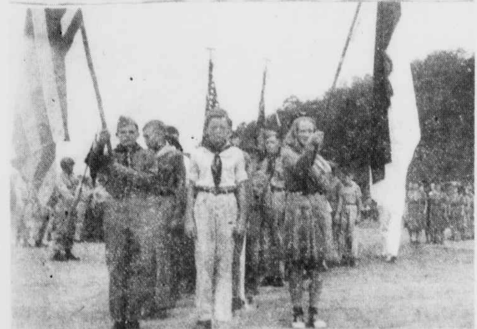
INDEPENDENCE DAY CELEBRATION — Pictured above are some scenes from the Fourth of July celebration in Murphy. At top are members of the 82nd Airborne Division, Fort Bragg, who came here to participate in the parade and other activities of the day. When the picture was taken they were parading on the Square, headed toward the fair