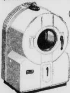
$239.50 STANDARD MODEL