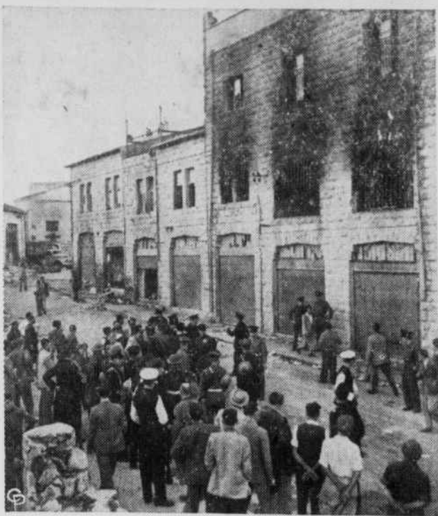
FOLLOWING ONE OF THE MORE VIOLENT outbreaks of rioting, looting and burning in Jerusalem, police officials inspect the wrecked remains of business places. Standing on the sidelines watching are both Arab and Jewish groups. A showdown battle is expected soon.

so that they can see just how the lanes and testing equipment will operate. The Department wants all repairs to thoroughly understand the whole Mechanical Inspection Program, as the job of making repairs on vehicles rests solely with them.