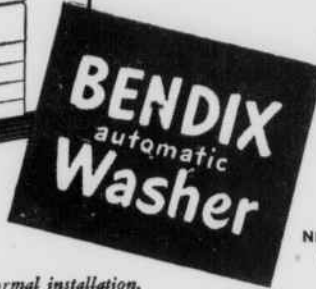
NEW BENDIX DELUXE MODEL (Automatic soap injector extra) $249.95