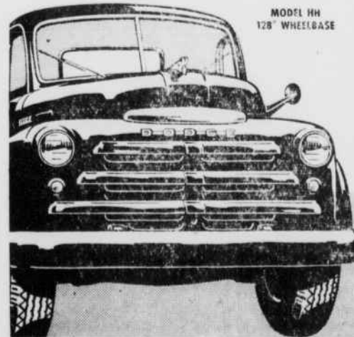
MODEL HH 128 WHEELBASE