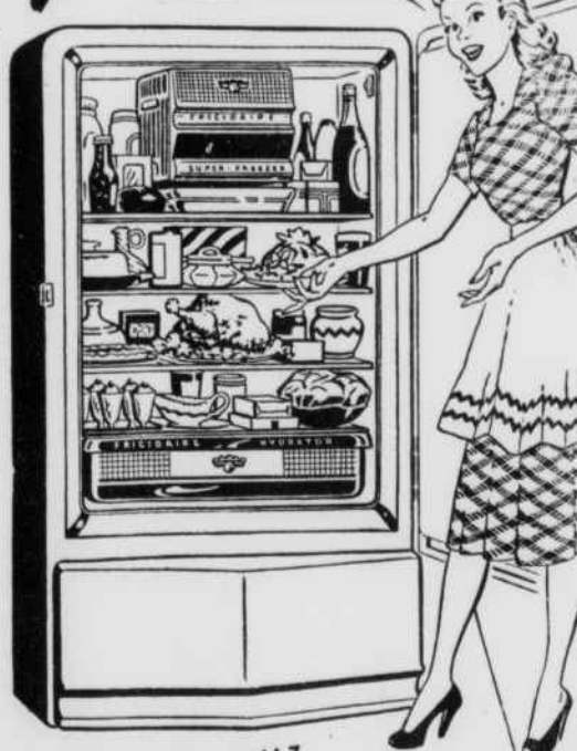
Model Shown is MJ-7

Holds more food Than ever before in the same kitchen space!