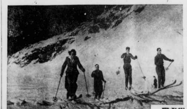
It's time out for winter sports as American soldiers and an Army hostess ski down the slopes of Zugspitze, the highest point in the Bavarian Alps. Skiing is one of many outdoor recreations enjoyed by U. S. Army occupation troops in Europe.