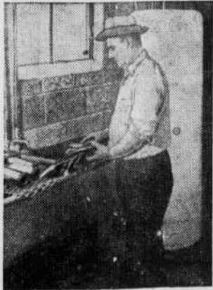
IT TAKES hot water—and plenty of it—to clean milking utensils adequately.

Like ham and eggs, running water ind water heaters go together. These win conveniences do as much as any-thing to bring urban living conditions