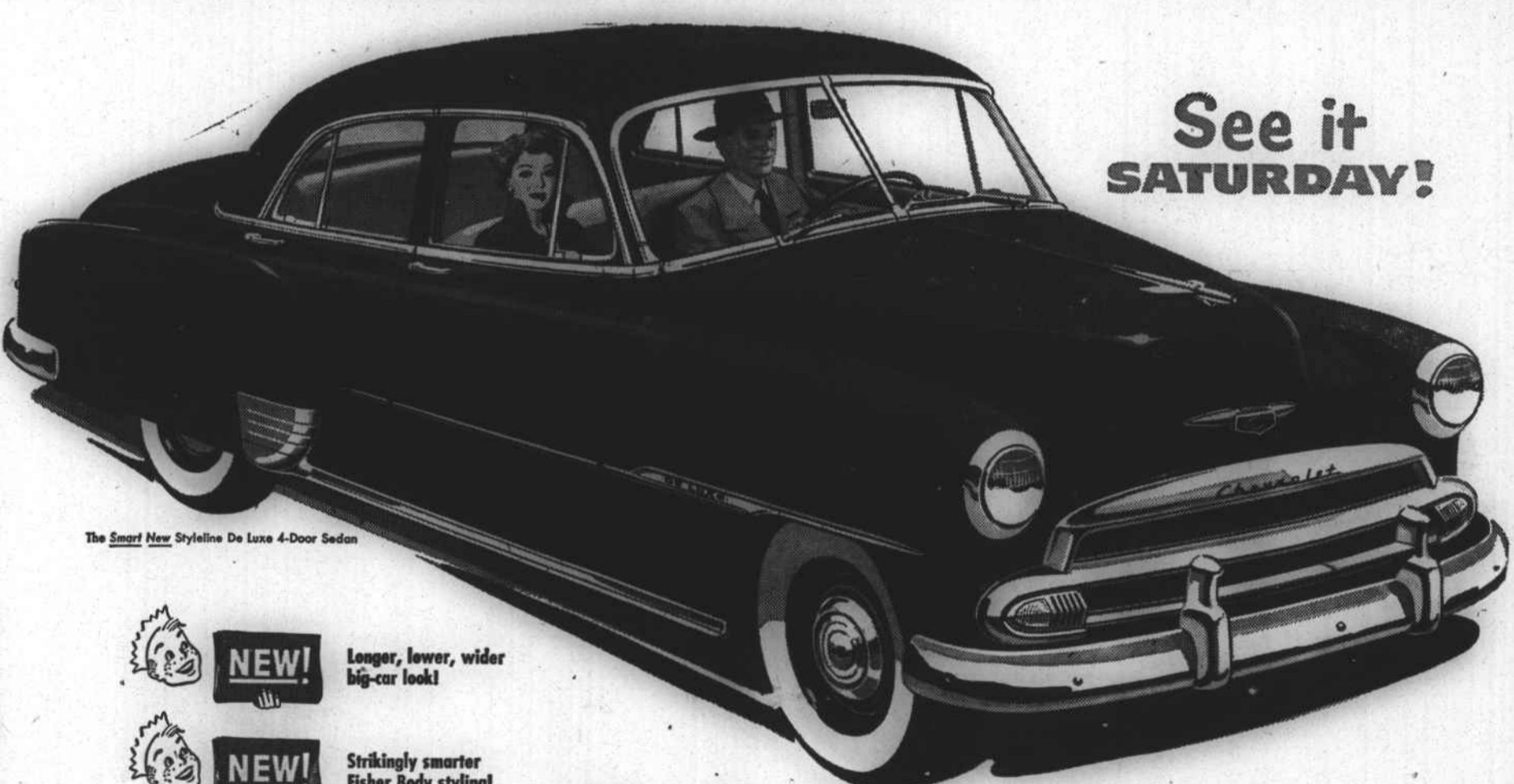
The Smart New Styleline De Luxe 4-Door Sedan