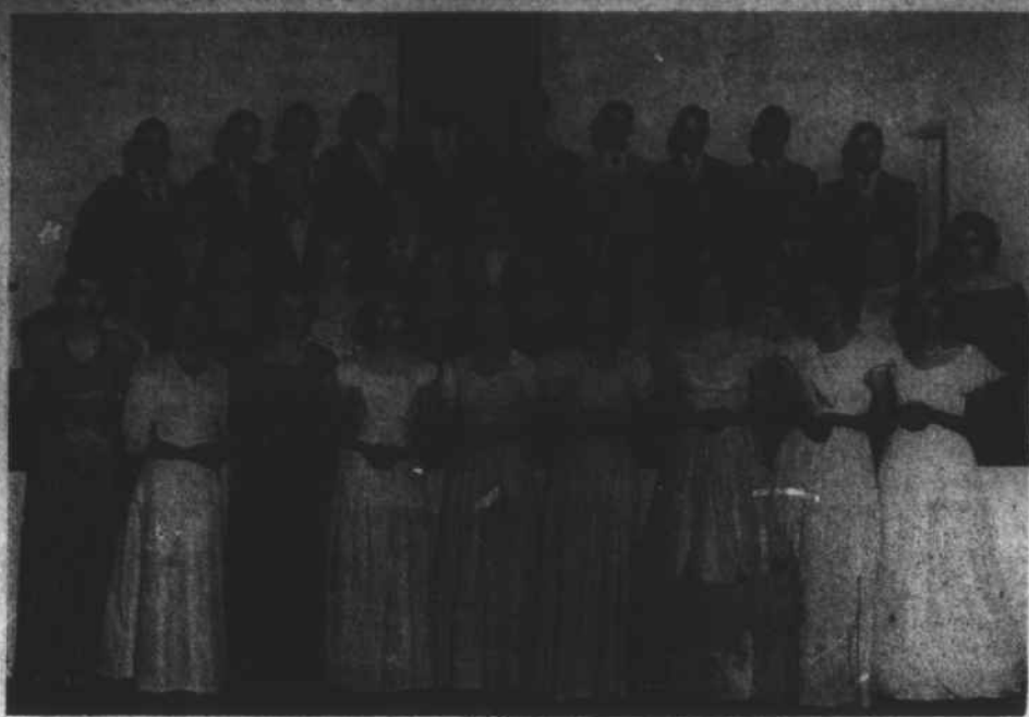
TO GIVE PROGRAM—Truett-McConnell College Choir, which will give a program at the W. N. Memorial Baptist Church, Hayesville.