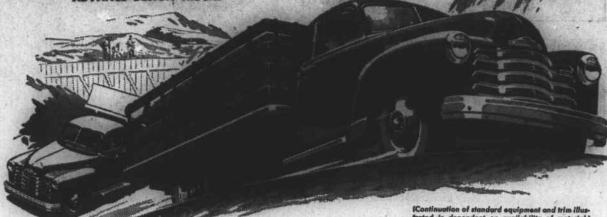
(Continuation of standard equipment and trim illustrated is dependent on availability of material.)