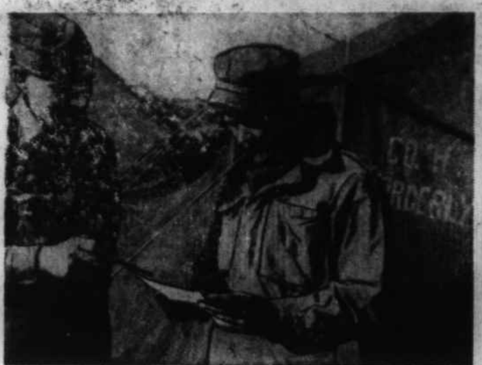
That's the news a Red Cross field director brings to this G.I. in Korea. Emergency communication is one of the many services performed by the Red Cross for American troops all over the world.