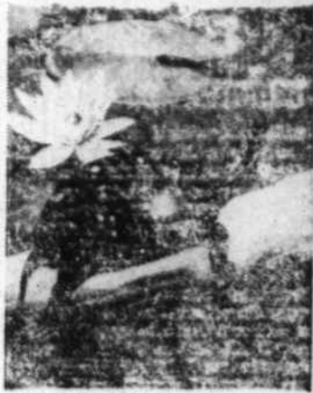
Spotted Turtle

Cream together shortening, sugar and unsulphured molasses. Beat in egg whites. Add flour, soda, salt and coconut; mix until blended. Spread batter on a greased, waxed paper lined, jelly roll pan, 15 x 10 x 1-inch. Bake in a moderate oven (350° F.) 30 to 35 minutes. Turn out on baking sheet, remove pan; turn right side up. When cool, cut into bars 1 x 2 inches. YIELD: 75 bars.