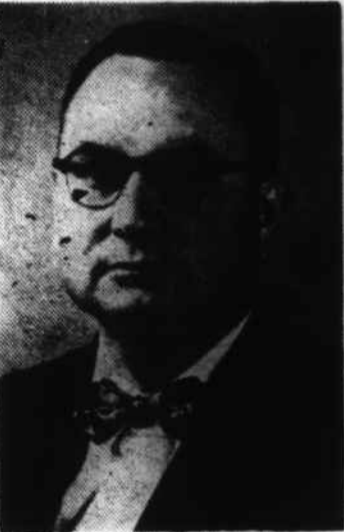
PERHAPS THERE'S NO HURRY

... to decide about your insurance plan. But when it's too late, then all the speed in the world won't help. Complete your insurance plan now while you are still insurable!