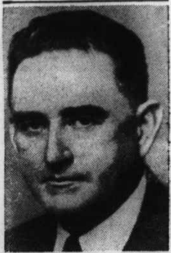
GOV. KERR SCOTT

The Bishop welcomed the new communicants into the Episcopal Church. In his message he said that no one who has not had a personal experience in Christ can speak with any authority about christianity, no matter how much they know about the scriptures and the church. He encouraged those who had been helped by the revival to keep this new beginning by worshipping in the churches of their choice and studying the holy scriptures.