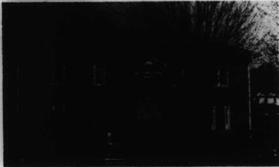
Murphy Library, Established In 1922