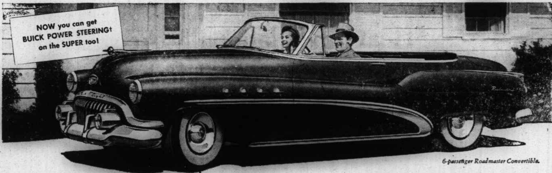
6-passenger Roadmaster Convertible.