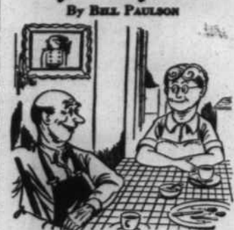
"We used to eat hamburger because we were broke. Now we eat it—and go broke!"

TWIN-CITY DRIVE-IN THEATRE McCasville, Georgia Shows, 7 and 9 o'clock Sunday, 8:30