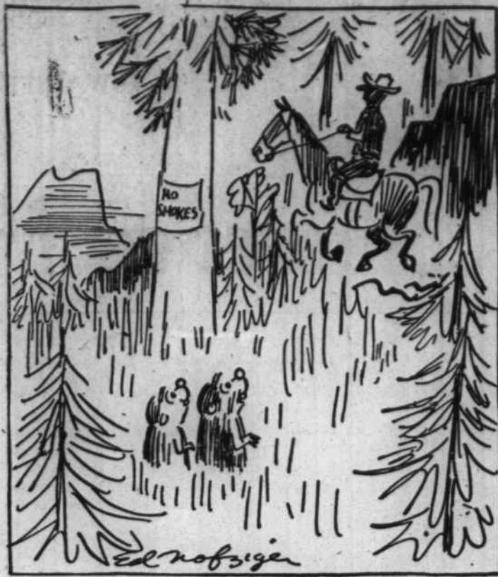
Forest Service, U. S. Department of Agriculture

"Not until the commercial timber of the East and South were almost gone did this country wake up to the problems of conservation."