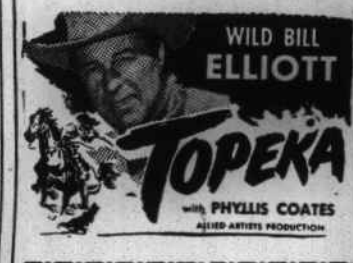
LATE SHOW, Sat., Sept 28