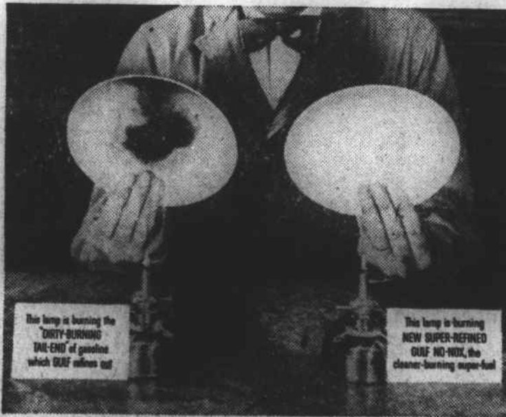
This lamp is burning the DIRTY-BURNING TAIL-END of gasoline which GULF refines out

Warp's Top Quality Window Materials Are Not Sold By Mail Order Houses TAKE THIS AD WITH YOU TO YOUR DEALER