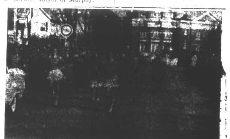
Murphy's own finest struts their stuff for the 8 The Murphy High School Band, showing marked in the past two years, was in wonderful shape for the parade. The outstanding Robbinsville High School Band was also in Murphy for the.

Pres. Toasimaster's club, Glenn State College will be on hand to discuss the things that may effect (Continued on page 10)