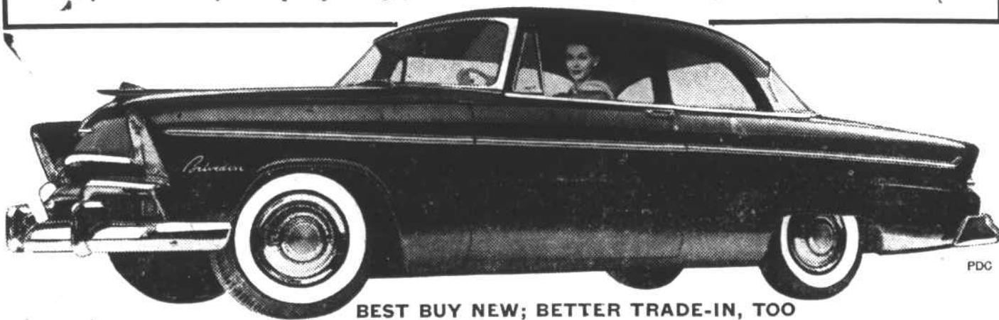
BEST BUY NEW; BETTER TRADE-IN, TOO

that, model for model , Plymouth sells for much, much less than medium-price cars, and gives you more car for your money!