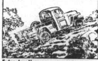
Extra traction of its 4-wheel drive takes the 'Jeep' truck up 60% grades — through mud, snow, sand. It shifts into 2-wheel drive for highway travel.