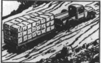
Towing: With the extra traction of its 4-wheel drive, it tows heavily loaded trailers, on the road or off the road.