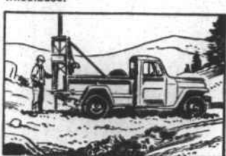
Mobile drill, mounted on the 'Jeep' Truck, is operated from the truck engine, through power take-off.