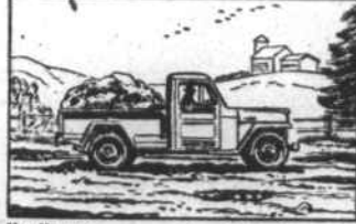
Hauling: The rugged 'Jeep' Truck carries a one ton payload... 63% of its curb weight! 6,000 lbs. G.V.W., 118 inch wheelbase.