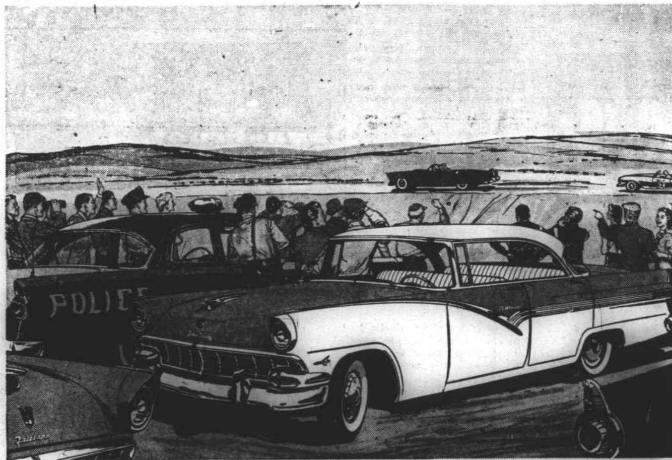
The Thunderbird's own record-setting 312 cubic inch engine can now be yours in most Ford models.

Better you should make haste to the nearest "mad" or sane hatter in our area and ask to see the new Lee-Dynel miracle. Then, place it lightly in the little woman's hands and discreetly point out the perfections of this newest of scientific achievements, inspired, no less, by her very own wifely virtues. Now there's a hat tip that may readily be the beginning of Shangri La in your home life.