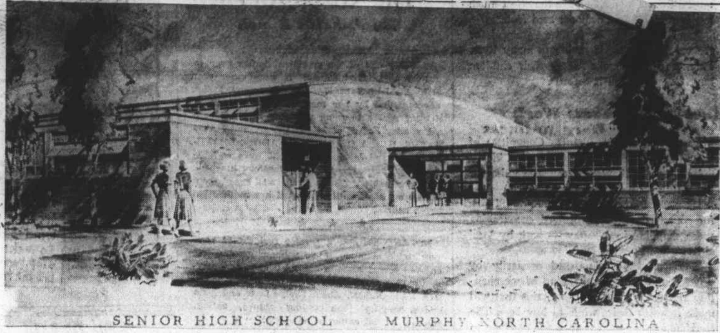
SENIOR HIGH SCHOOL MURPHY, NORTH CAROLINA