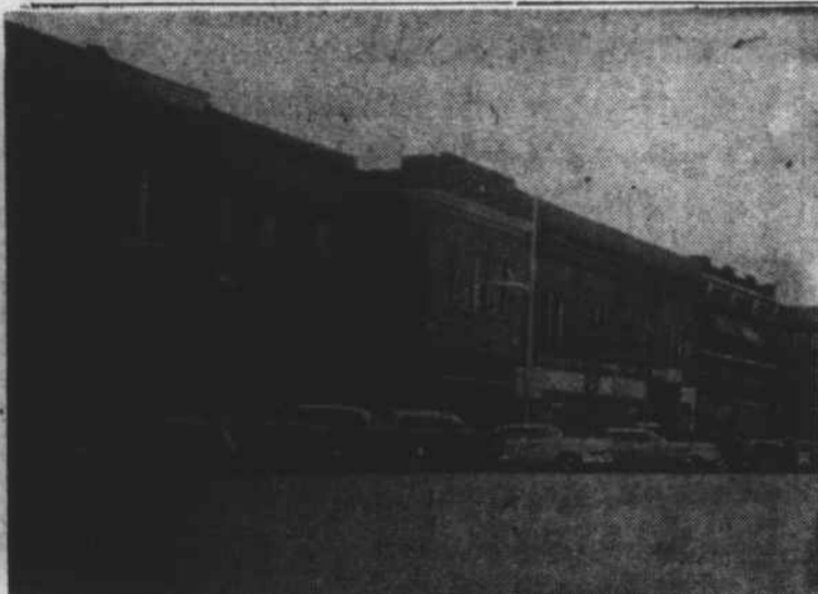
Murphy Is Sale Town This Week Hundreds are taking advantage of the many values merchants are offering. This is an opportunity to save.