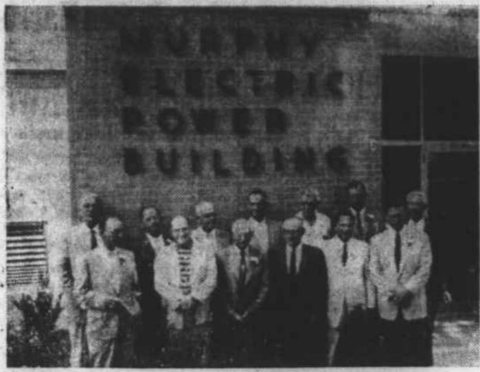
AT GRAND OPENING — Murphy Electric Power Board and TVA officials were on hand for the grand opening of the new Power Board building here last week.

Andrews has been raising its quota and retaining unbrokenly the blood bank and other Red Cross services.