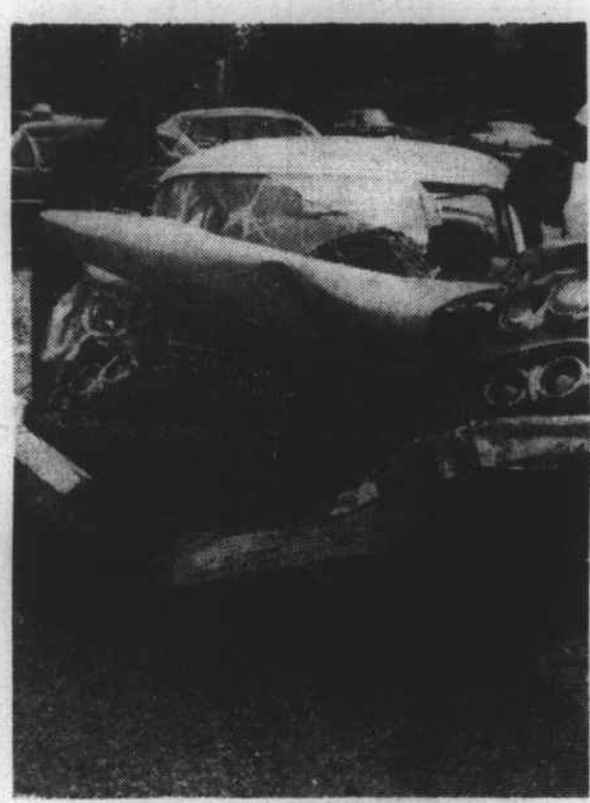
GIBSON'S 1958 CHEVROLET