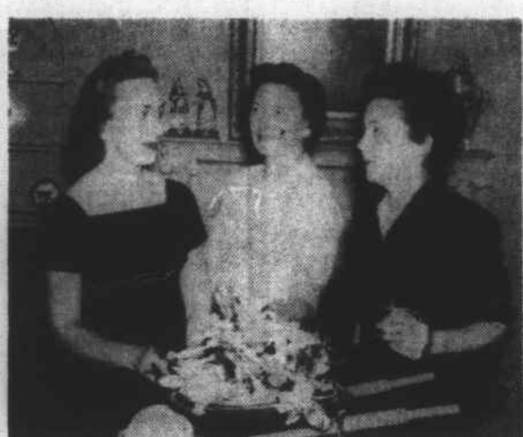
FLOWER SHOW CHAIRMEN

CHECK YOUR LABEL If Your Scout Mailing Address Label Reads October 1960 Your Subscription Expires Next Month RENEW NOW The Cherokee Scout