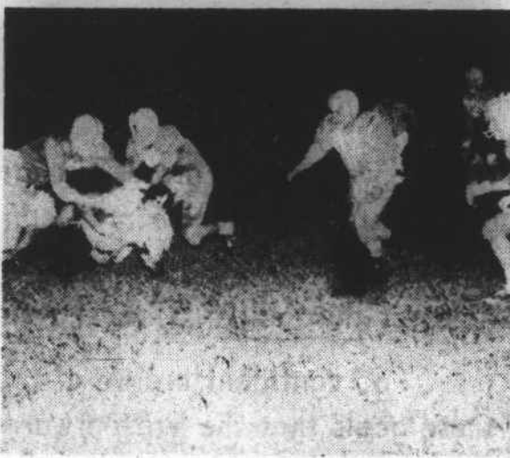
Almost Hits Paydirt