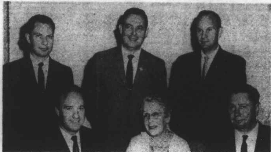
Attend Democratic Organizational Meeting