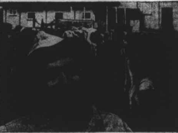
Johnny Rouchon's concrete tilt-up building has six separate sections under one roof. Besides the main barn, he has a big feed room, milk room, sick bay, office and pump room. Plenty of space to handle his 100 milking cows.

"I WAS planning on brick until I heard about this new concrete tilt-up method. I got the building I wanted in concrete for $12,000 to $15,000 less—and used the same plans. I'm planning a new calf barn and I figure it will cost only 60¢ a square foot, even including a concrete floor. That's plenty low for a durable, maintenance-free building."