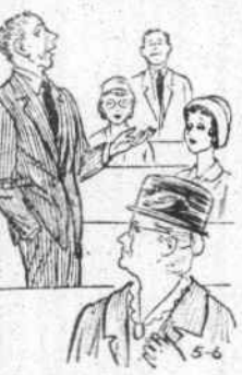
Jim stands for the right thing in public and sins in secret, but he ain't no hypocrite. Bein' weak don't make a man dishonest for admiring strength.