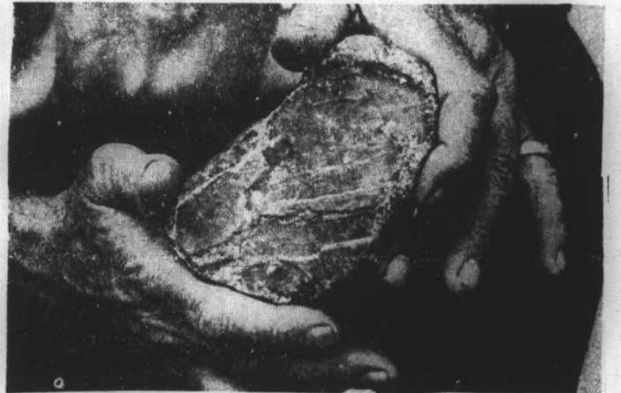
FOUND ONLY IN CLAY COUNTY. This is the picture which touched off the rush to the gem fields of Cowee Valley last week. This sapphire was reported in both daily and weekly papers across the country as being found in Macon County. Evidence has been gathered by the Tri-State Rockhounds Club, Inc. that this specimen was actually found over four years ago in Clay County.