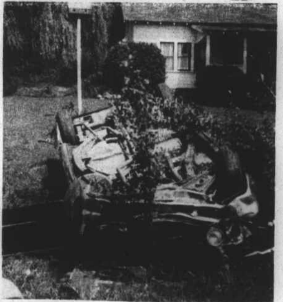
FINAL RESTING PLACE of a 1960 Ford wrecked on US 64 in the Peachtree Straight shortly after 10:00 A. M. Wednesday morning. TWO LOCAL BOYS INJURED.