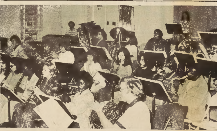
The concert band of PSU practices for the special Christmas concert to be PSU Performing Arts Center.