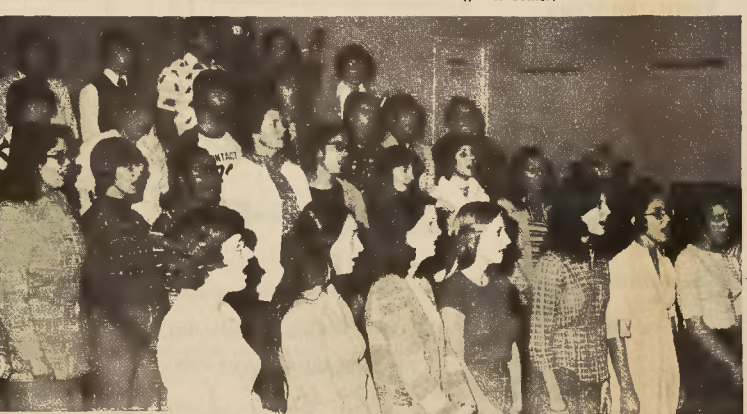
The PSU concert choir rehearses for the special Christmas concert to be presented. Let Tucsday night, Dec. 7, in the PSU Performing Arts Center.