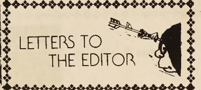
LETTERS TO THE EDITOR