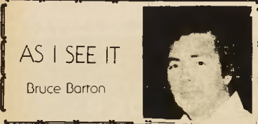
JUSTICE IN ROBESON COUNTY SEEMINGLY IS RESERVED FOR DARK SKINNED FOLK

If you are his daughter or his son, you too can touch him for you are told by Christ not to fear him, but to believe only and we shall be made well through the name of Jesus. You can have your own, if you believe. I have given you Webster's dictionary or a book from a sermon school, but I have used God's holy word which he said would stand. I have not turned his word around to suit you and I. But it is his word and God does not lie. I have not tried to build on another foundation for there is no other to build on. If