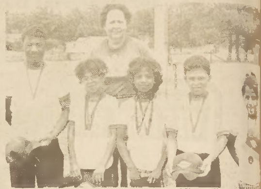
These children participated in the North Carolina Special Olympics, May 20-22, 1977 at High Point, North Carolina. They participated with children in their own age groups.

Prior to this event they took part in the Robeson County Special Olympics and the Regional Eight Area at Fort Bragg.