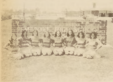
Pembroke Senior High School Varsity Cheerleaders.