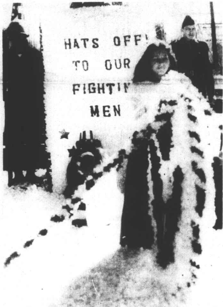
The slogan says it all: the purpose for the VFW Parade in Pembroke on November 11 was to honor the veterans of foreign wars, those who gave their lives on foreign battlefields and those still living. See more VFW Parade scenes on page 7.

Local singing groups are cordially invited to participate and the public is cordially invited to attend.